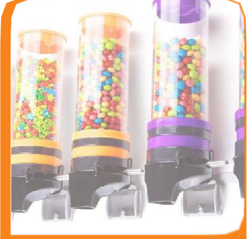
Click Topping 39-44