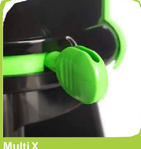
Multi X 23-29