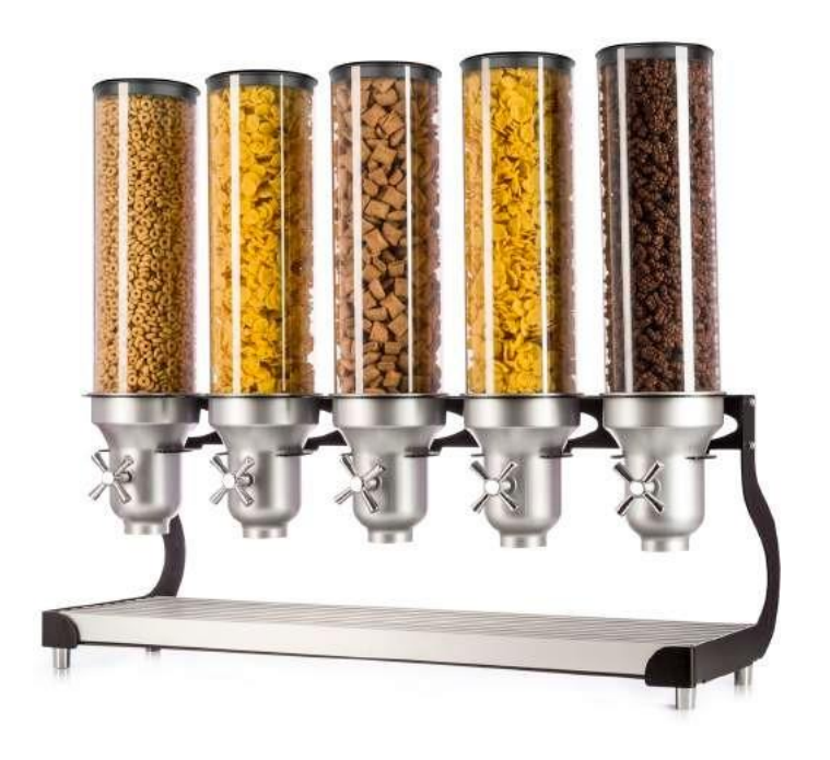
> ACD50-BL #9915-52

Specifications: weight: 4.9 kg capacity: 5 Lt. each size: 32L x 28W x 65H cm