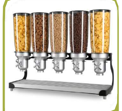
Pro Serve 45-57