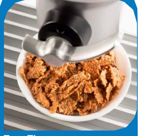
Free Flow 12-17